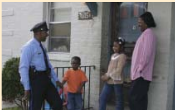
PHAPD Officer with family

PHA is committed to a comprehensive approach of improving community security at PHA developments and supporting the Housing Choice Voucher Program initiatives. PHA developments have become safer communities as a result of an extensive site-based, community-policing program undertaken by the PHA Police Department. PHAPD utilizes a comprehensive approach to crime reduction that emphasizes crime prevention, conflict resolution, resident involvement and community partnerships.