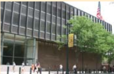
James A. Byrne U.S. Courthouse

PHA's aggressive legal strategy resulted in numerous major court victories over the past year, saving the Authority millions of dollars, now and in the future.