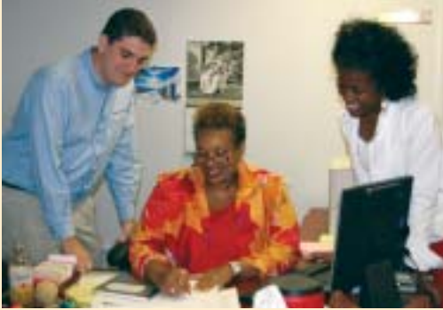
PHA Finance Department

PHA continued to undertake efforts to improve productivity, fully utilize available resources, and identify opportunities for cost savings. The effectiveness of PHA's efforts is underscored by the A+ credit rating awarded the agency by Standard and Poors. Productivity and cost effectiveness initiatives took many forms during the past year: