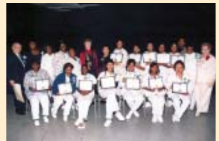
Certified Nurse Assistant Program graduates

New computer classes were officially kicked off in January 2004 at the Family Self Sufficiency Computer Lab. Computer Training Classes are divided into two levels, Beginning and Advanced. The beginning class is a 10-week class and the advanced class is a 12-week class. During the