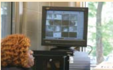
West Park Apartments security