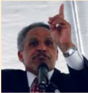
Mayor John F. Street, Chair