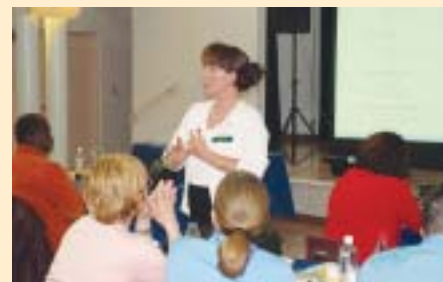
LIHTC Training Seminar