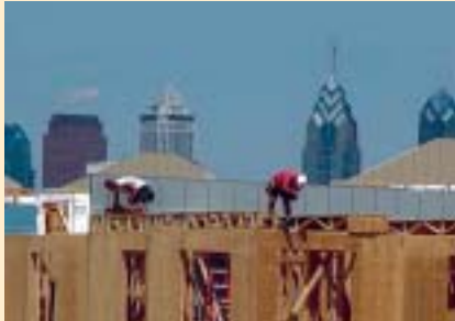
Tasker Homes Construction– South Philadelphia

program, providing hundreds of jobs and business opportunities for public housing and neighborhood residents and local businesses.