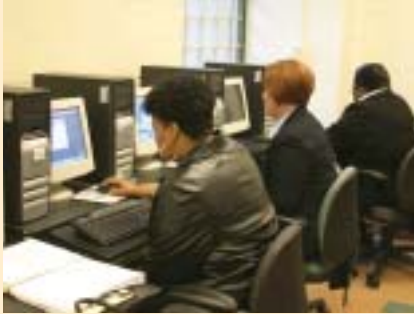
Blumberg Self-Sufficiency Center