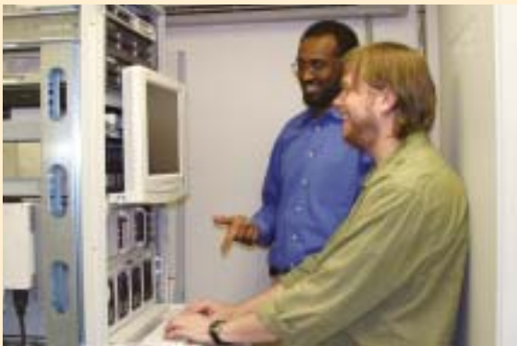
PHA's Information Systems Management department

Over the past six years, PHA has dramatically upgraded the use of computer technology to expedite and streamline customer service, management reporting and processing of daily transactions. The Information Systems Management (ISM) department includes highly qualified programmers, technical support, networking and other staff whose job is to develop and implement new initiatives, while maintaining and supporting existing applications and systems. ISM also works to ensure that PHA employees are fully equipped with technologies and tools necessary to accomplish their jobs. In the past year alone, hundreds of PHA employees have participated in training sessions designed to improve their computer competency and proficiency.