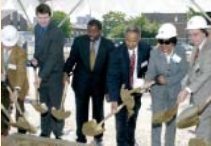
Lucien E. Blackwell Homes groundbreaking

PHA continued its collaboration with local, state and federal governmental partners to leverage PHA resources and collaborate on projects to improve the quality of life for PHA residents: