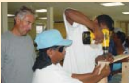
Pre-Apprenticeship Program Class

Many other PHA residents received homeownership counseling in preparation for their entry into homeownership. The Homeownership Division provided homebuyer's club workshops to over 500 clients last year. PHA also established partnerships with major banks including Fleet Mortgage, Citizens Bank, Wells Fargo and Wachovia Bank, and various mortgage companies who have committed in writing to provide in-kind services totaling $657,000. The services include free credit reports, budgeting/money management, counseling, and credit repair.