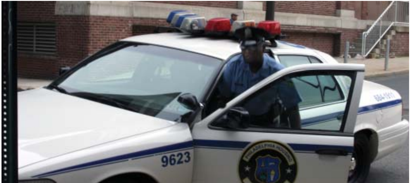
PHA Police on Patrol

PHA continued and expanded its comprehensive approach to improving community security at PHA developments over the past year. PHA developments have become safer communities as a result of an extensive site-based, community policing program undertaken by the PHA Police Department. PHAPD utilizes a comprehensive approach to crime reduction that emphasizes crime prevention, conflict resolution, resident involvement and community partnerships. The results are encouraging: over the past two years, Part I crimes have decreased 28% at PHA conventional sites and 47% at scattered sites. The overall reduction at PHA properties from calendar year 2001 to 2002 was 24% for Part I crimes and 29% for Part II crimes.