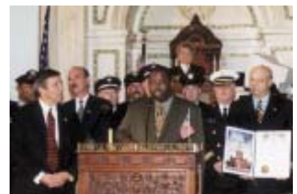
PHA enjoys a cooperative working relationship with Philadelphia City Council.