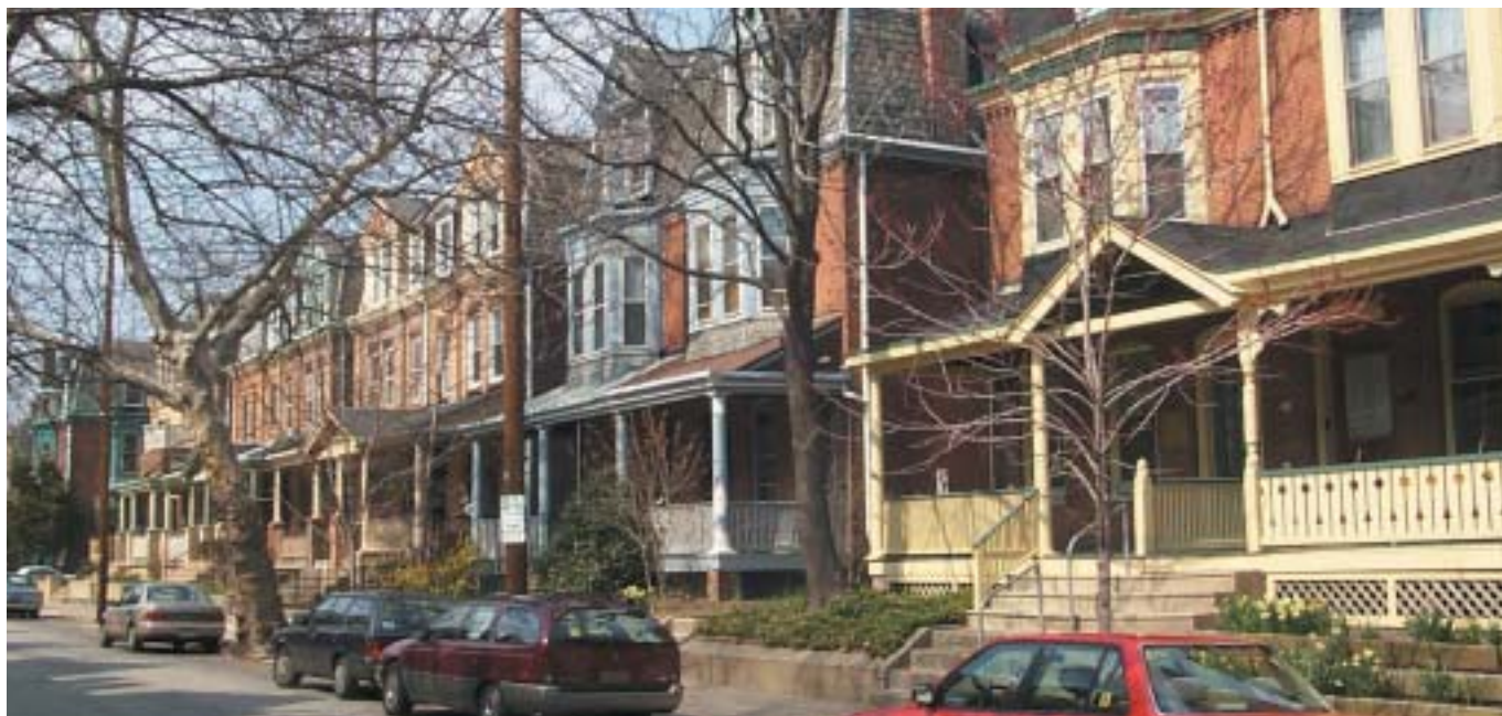
Housing Choice Neighborhood

PHA's Housing Choice Voucher Program (formerly known as Section 8) provides rent subsidies to approximately 15,691 low-income households living throughout the City of Philadelphia. In the past year alone, PHA assisted 1,747 new households through the HCV program.