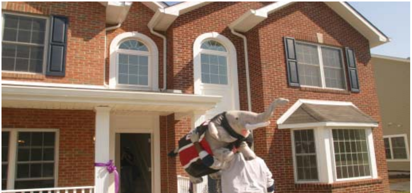
Richard Allen Phase III Grand Opening

Over the past year, the Philadelphia Housing Authority (PHA) continued to make dramatic strides in accomplishing its core mission and meeting its Strategic Operating Plan objectives. This report provides a summary of major agency accomplishments for the fiscal year period from April 1, 2002 through March 31, 2003. The accomplishments described in this report underscore the dramatic progress made over the past five years in revitalizing PHA communities, expanding the provision of employment, training and other services to PHA residents, upgrading the Housing Choice Voucher Program, building partnerships with local organizations, and implementing improvements throughout all levels of PHA's management operations.