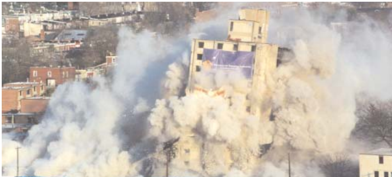
Mill Creek Implosion

PHA communities have suffered from decades of neglect and under-funding. Therefore, over the past five years, one of PHA's primary areas of focus has been to obtain the resources needed to fully revitalize existing public housing communities and to move construction activities forward at a fast pace. In addition, new development activities are also a priority for PHA as they can offset the loss of units resulting from density reduction at HOPE VI sites and contribute greatly to the City's neighborhood revitalization efforts.