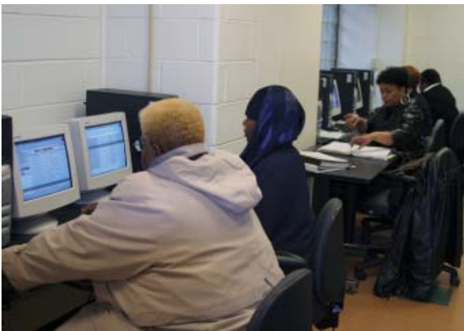
Blumberg Self Sufficiency Center