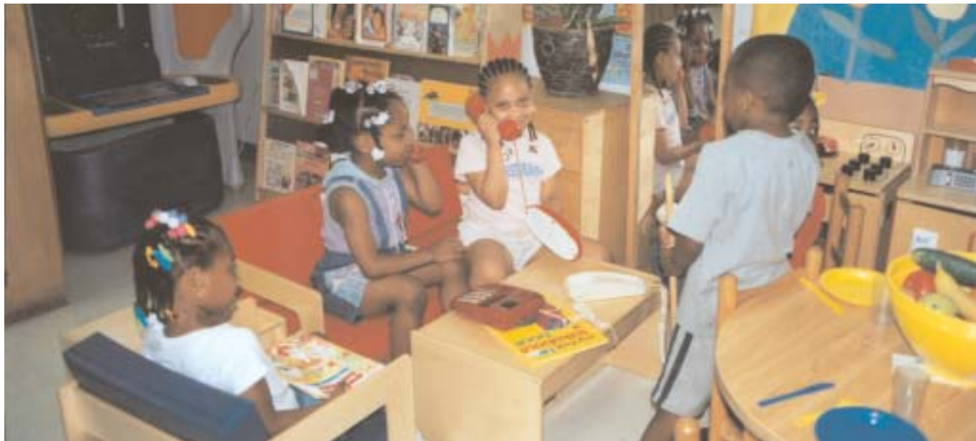
Day Care Center

PHA continued and expanded its efforts to enhance resident economic self-sufficiency during the past year. Through a wide range of creative partnerships, PHA sponsors and/or directly operates numerous economic self-sufficiency and social service programs. The goals of these programs focuses on assisting residents to maximize their individual potential, build self-sufficiency skills and become involved in positive, uplifting activities. Residents of all groups are serviced through these initiatives including early childhood development, youth after school, adult employment and training, and senior service programs. Supporting residents to become homeowners through programs such as 5-H, Section 8 Homeownership, Turnkey III and HOPE VI Homeownership is also a primary focus of PHA activities under this broad goal area.