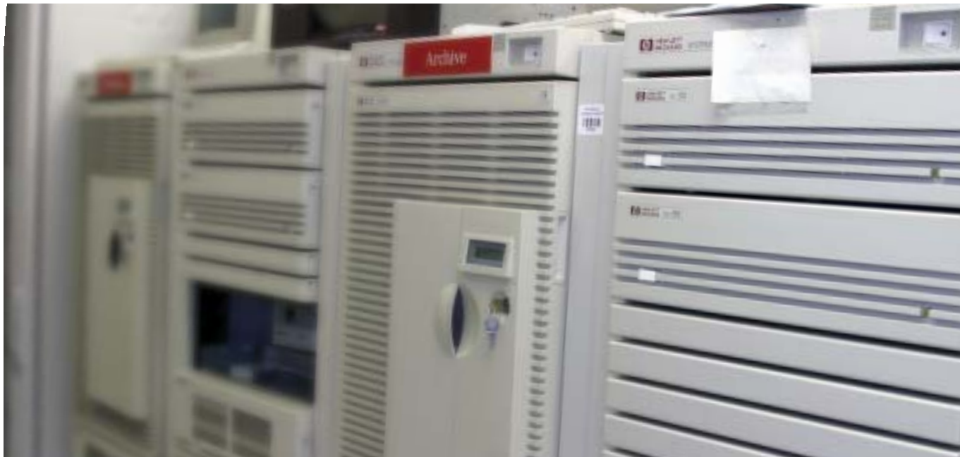
PHA Data Center

PHA continued and expanded efforts to incorporate best practices technology into all phases of PHA operations. Over the past five years, a solid Information Technology framework has been established incorporating industry-standard network equipment, upgrading or replacing mission critical software applications, building a qualified and responsive technology staff, and improving the capacity of all PHA computer users through extensive training. The previously cited Standard & Poor's review of PHA operations noted PHA's "...highly sophisticated technological capabilities" which exceed those of any other housing authority that S&P has evaluated. Key activities from the past year included: